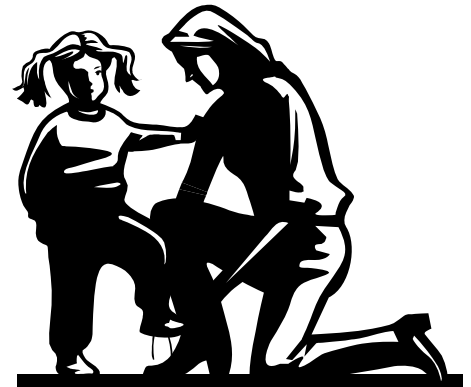
Discipline is teaching