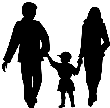
Consistency across adults is helpful

Children learn more easily when the same “contingencies” (rules) apply every time a situation arises. When an adult allows a behavior to occur sometimes, but other times doesn't, the child has a 50-50 chance of displaying the behavior again. A parent or teacher should therefore be fairly consistent to increase the odds of the child learning appropriate behavior.