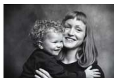
Keep a child engaged to prevent behavior problems

Some parents and teachers are masters at preventing behavior problems by keeping children busy. Children can do only so many things at one time, so, if they are appropriately "engaged" in a game, with a toy, or just hanging out with other people, they are less likely to be